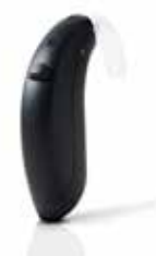
MINI BTE MODEL